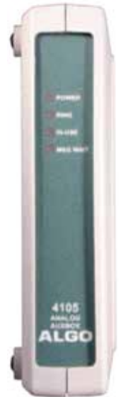
4105 Front Panel View