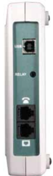
4105 Back Panel View