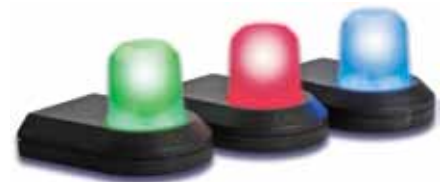
Available in green, red, or blue